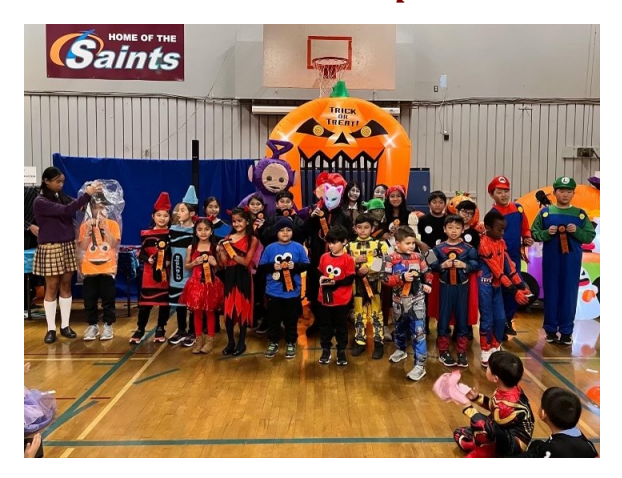
Dynamic Duo Costumes