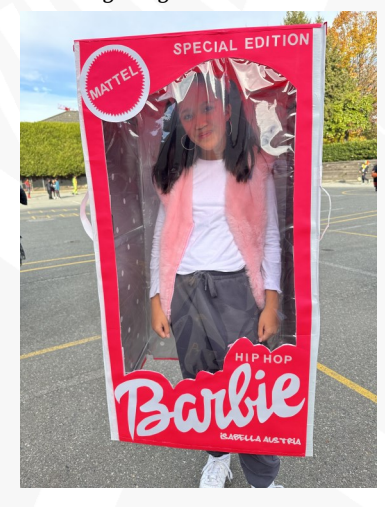
Hip Hop Barbie