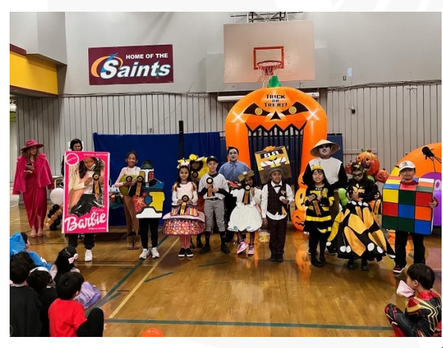
Most Original Costumes