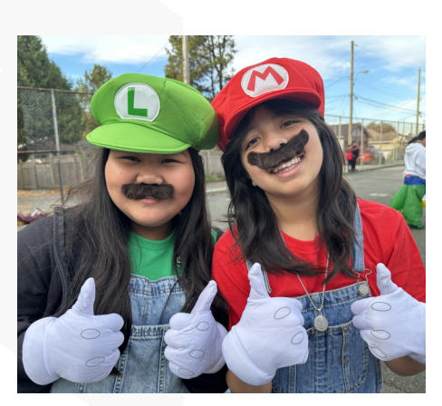
Love the stashes