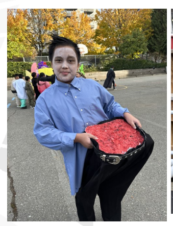
Detached at the hip