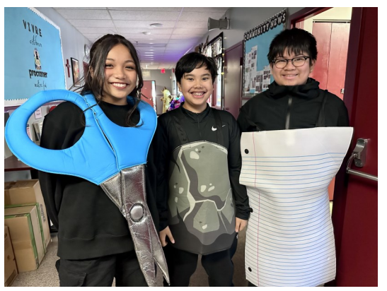
Scissors, rock, paper? Wrong order!