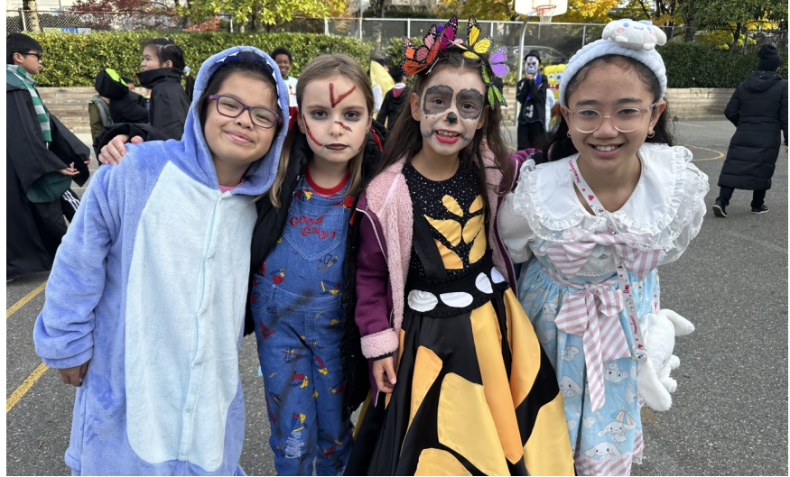
Hanging out with friends in our fun costumes