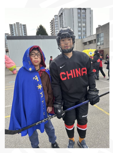
Wearing the gear