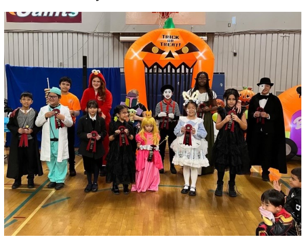
Best Character Costumes